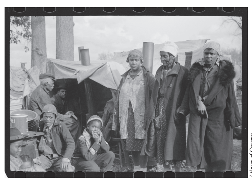
African Americans were among the first to be fired and the first to be evicted. The photo above (Jan 1939) is titled, "Evicted sharecroppers along Highway 60, New Madrid County, Missouri."

As this data indicates, the Great Depression affected virtually all Americans but African Americans were hit hardest. African Americans were among the first to lose their jobs as the economy shrank. <sup>2, 6</sup> As early as 1932, approximately half of blacks were out of work.<sup>2</sup> In some northern cities, whites called for blacks to be fired from any job if any whites were out of work.<sup>2</sup> Many African American women were forced to take full-time domestic jobs for almost no payonly $5 per day in some cities<sup>4</sup>—because they were not eligible for Social Security. Their only alternative was to remain unemployed and have no income at all. About 20 million Americans turned to public and private relief agencies for assistance during the Great Depression,<sup>4</sup> but this number would have been higher if everyone in need had been eligible for help.